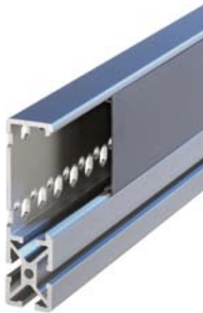
Standard section for roller conveyors

Every product shipment requires previous order picking. For fine or batch order picking, picking from shelves or flow racks, RBS offers the suitable and proper conveyor components to meet maximum performance requirements. As early as in the planning stage, the special features of the shelf manufacturers are taken into account to ensure an optimum ergonomic design.