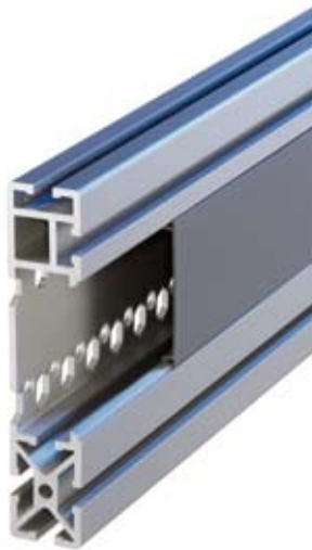
Section for roller conveyors